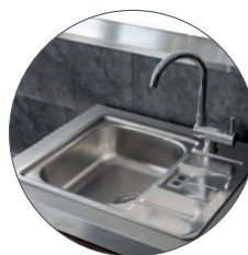
BUILT-IN SINK WITH FOLDING TAP