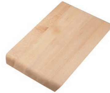
CUTTING BOARD – WOOD