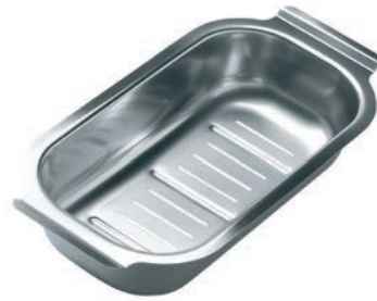
STRAINER INSERT FOR SINK